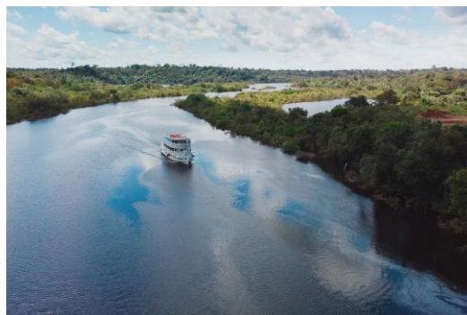
**Local Communities and National Forest